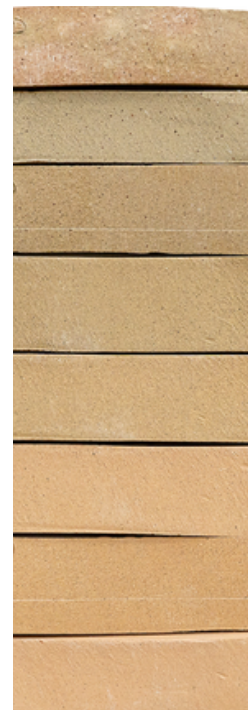
Chemical Analysis %